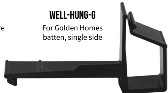
WELL-HUNG-G For Golden Homes batten, single side

No more messy, unsafe and time-consuming methods. Just clip on and go.