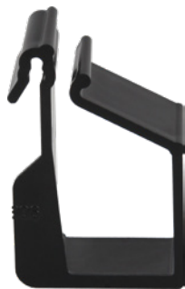
WELL-HUNG-C For catenary wire 2.5-5mm O.D