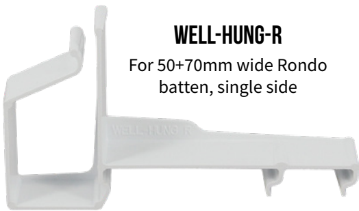
WELL-HUNG-R For 50+70mm wide Rondo batten, single side