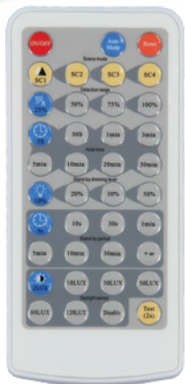
LEDIL58-REMOTE (sold separately)